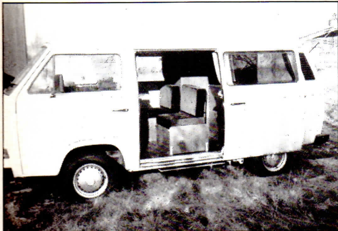
Rear seats in travelling position, with gangway between.