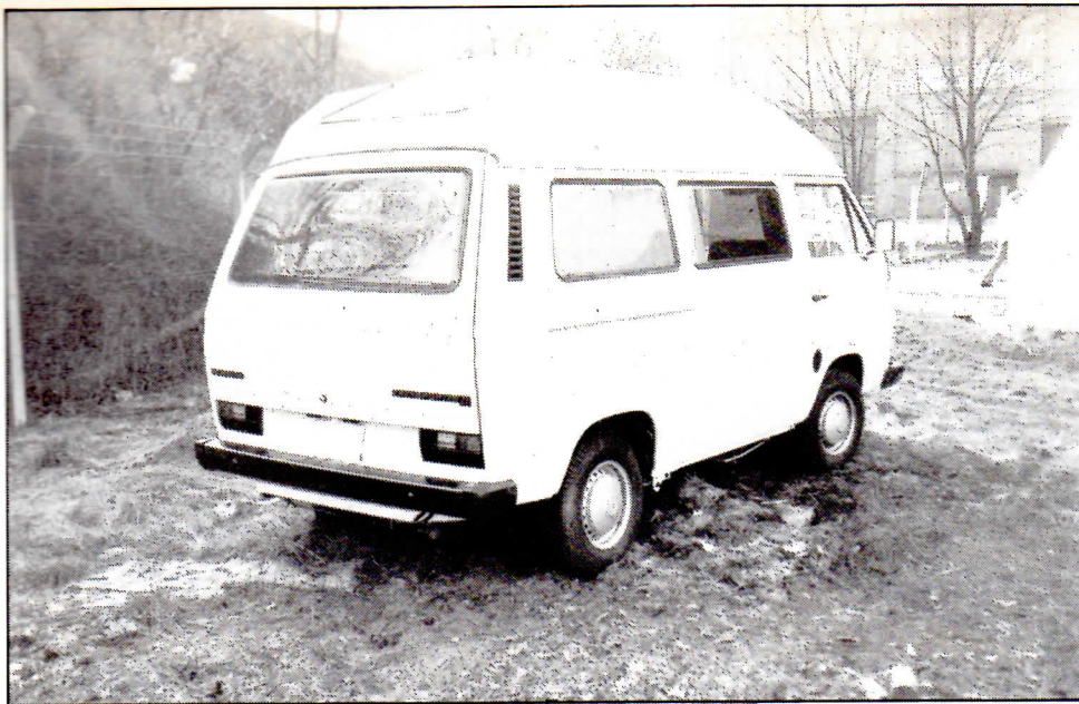
Smoothly contoured roof has luggage rack at rear.